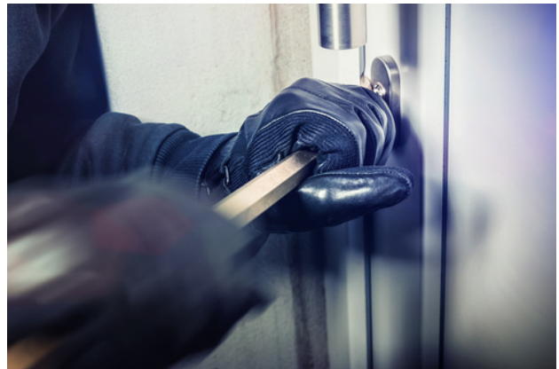
Figure 2: Successful break-ins can be prevented by installing or retrofitting burglar-resistant windows and doors.

Whether in the case of a change in the use of a building or an increase in building security without usage change - according to the Hueck experts, a subsequent increase in burglar-resistant measures is easy and inexpensive to implement. "As the only window system on the market, the Hueck Lambda windows can be upgraded to RC2 or RC3 at low cost and with little effort. In order to use our burglar-resistant GEN 4.0 window fittings, which have been tested in accordance with DIN 18104-1, the windows do not even have to be removed," explains Leimkühler. Hueck offers the lockable window handles necessary for all resistance classes in their own attractive handle design.