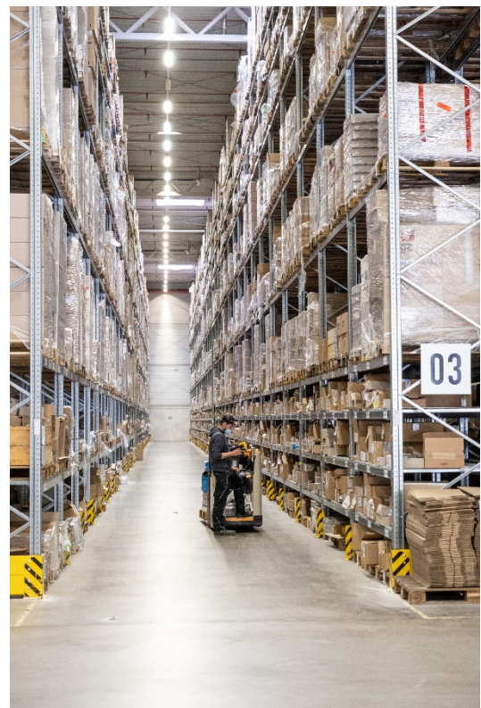
Figure 6: 3,800 pallet spaces and 1,800 shelf spaces are available to HUECK in the new accessories store