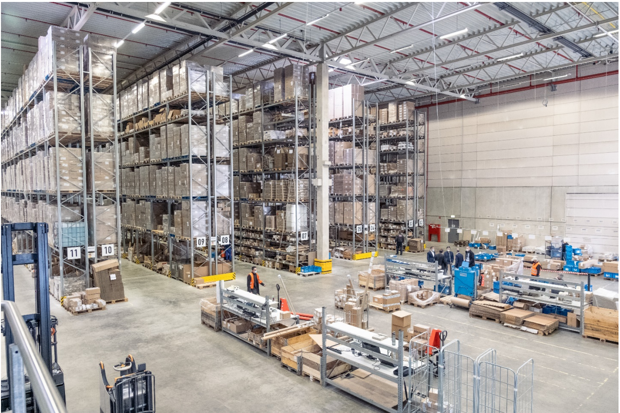
Figure 4: In the new warehouse, HUECK can benefit from a total of 4,000 square meters of storage space with the option of expansion