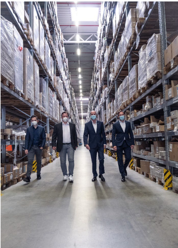
Figure 2: With the investment in the accessories store, HUECK is taking further steps towards higher customer satisfaction (source: HUECK)