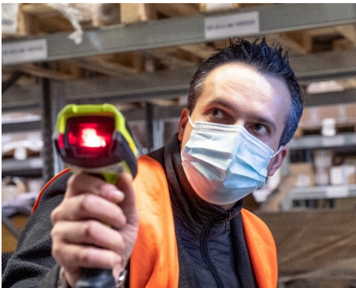
Figure 5: In the new warehouse, HUECK can benefit from a total of 4,000 square meters of storage space with the option of expansion